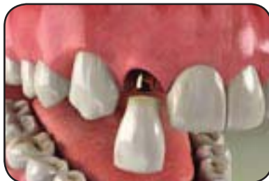
Implant with immediate crown placement